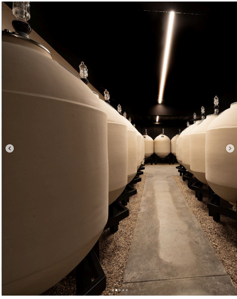
photo taken at Arnoux Lachaux

With precision, traceability, and food-grade certification guaranteed , the Clayver vessel allows for subtle oxygenation without altering acidity or pH levels . Durable, safe, and easy to clean, Clayver is revolutionizing wine aging by preserving its integrity while enhancing the true expression of the terroir.